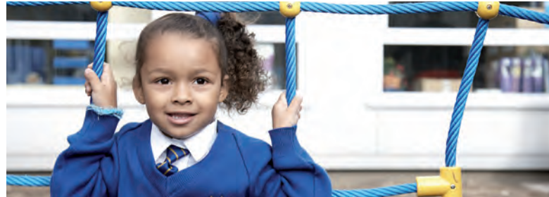
This is the picture caption